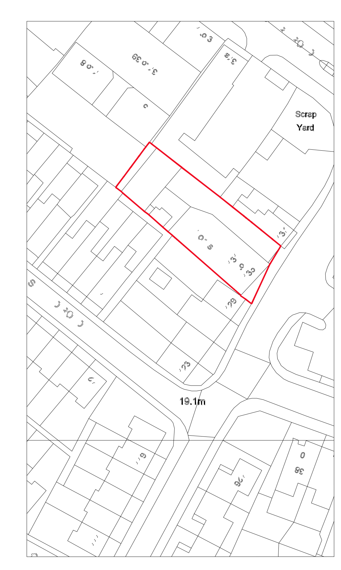
LOCATION PLAN 1:500

GROUND FLOOR FIRST FLOOR SECOND FLOOR ROOF PLAN